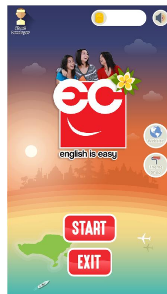
Figure 3 : Bali Theme

To any changes that happen when buying the theme in theme store will change all background in the game and several buttons. For example in Bali Theme will change the background into Balinese situation where writer uses several tourism object in Bali as references. The Tourism objects such as Pantai Karang in Sanur, Ubud Monkey Forest , and Pura Luhur Lempuyang in Karangasem. Here is the example of layout changes in Main Menu: