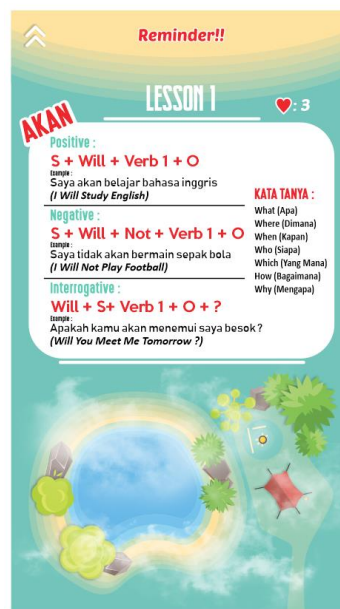
Figure 2 : Reminder

lesson 1 is chosen, so this layout will show the material learnt in lesson 1. The material that is shown refers to Book 1 of EC and the material that is summarized is as simple as possible so the user can understand faster about the material will be played. This is aimed to make the user can answer the questions that appear randomly. Here is the display of Reminder layout :