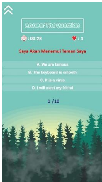
Figure 3 : Question and Answer

Design principle used in this layout is balance and rhythm, where layout in design and space utilization so that it is not seen as empty in the bottom part so that there is balance, and the use of rhythm design principle in the answer choices because it can create the moving feeling from one element to another elements when choosing the answer. The dominant colors used are cyan and green because these colors can create the feeling of calm and unhurried when answering the questions. With the back sound that support with quiet song.