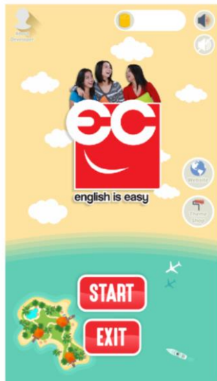
Figure 1 : Main Menu