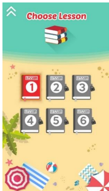
Figure 4 : Choose the Lesson

that is Book 1 . There are 6 lessons where each lesson contains 10 questions that will be randomized and showed in layout Question and Answer . Here is the display of Layout Choose the Lesson :